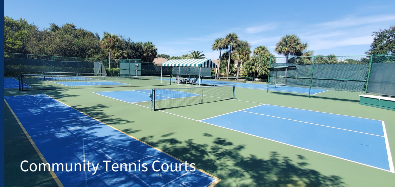
Community Tennis Courts